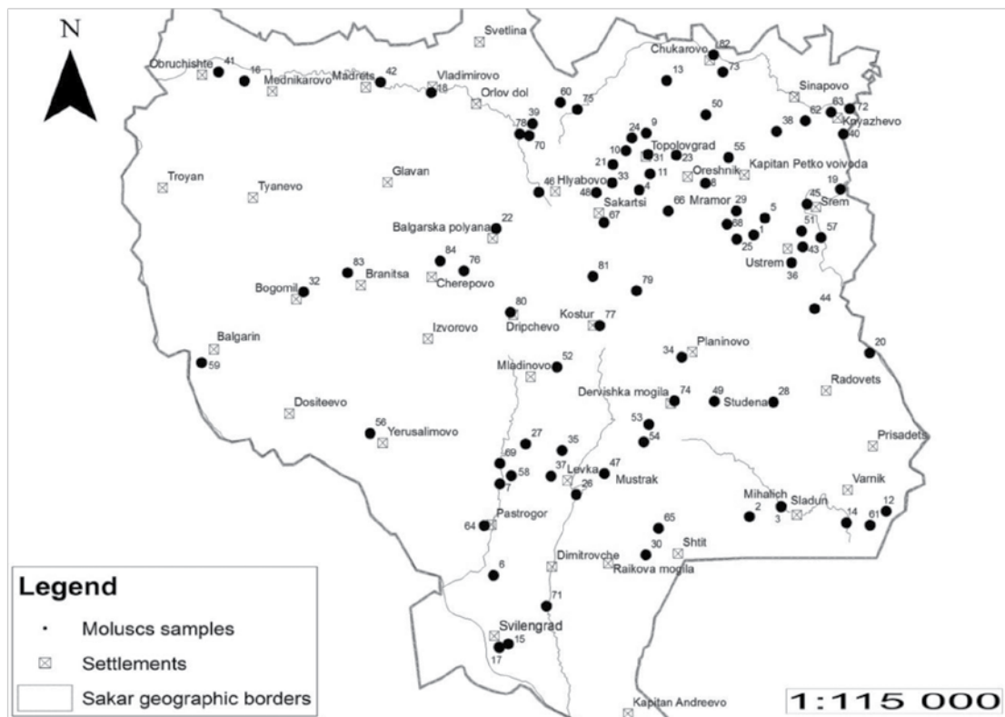
Fig. 1. Localities where molluscs were collected in Sakar Mountain.

Submediterranean element, Eastsubmediterranean subelement Vitrea neglecta Damjanov et L. Pinter, 1969, Southwestern Asiatic complex, Irano-Turanian subelement Vitrea pygmaea (O. Boettger, 1880), Asia Minor subelement Vitrea riedeli Damjanov et L. Pinter, 1969, Balkan Endemiks Cecilioides tumulorum (Bourguignat 1856), Bulgarian Endemix Vitrea vereae Irikov, Georgiev, Riedel, 2004.