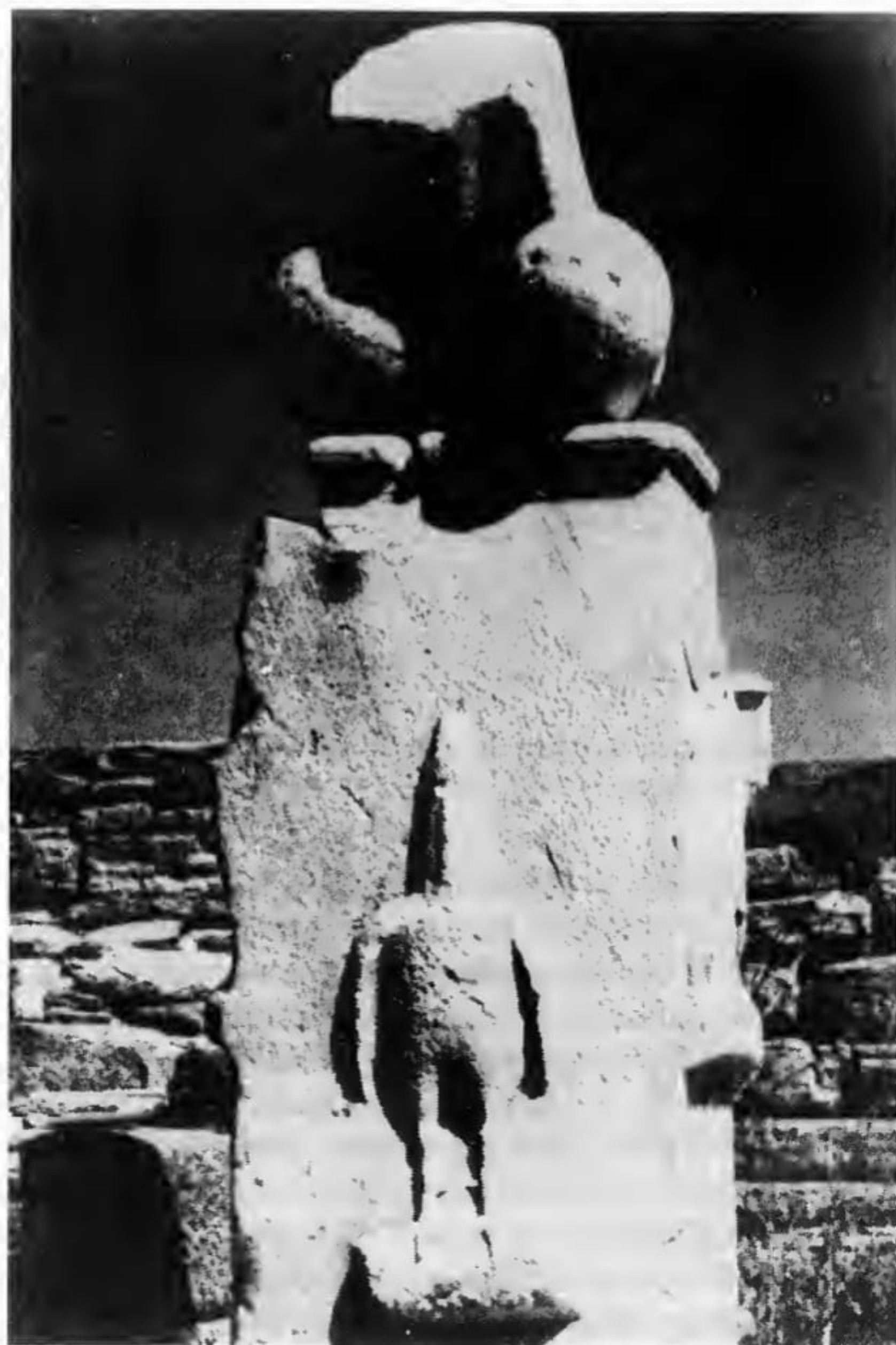
Fig. 2. A relief of a cock on a monument in honour of Dionysius from the island of Delos, Greece (3rd century B. C.) (after Т а х о - Г о д н, 1989)

Iskar River (off Gigen) (p. 231). Such an image exist indeed (Fig. 1), however with a clear mistake, as Oescus was a Roman town, not a Thracian one, and Oescus was in existence for about 600 years from the end of 1st century B. C. to the 6th century A.D. Thus the mosaic of Oescus may prove that the Domestic Fowl was already present in the Bulgarian lands by the end of the 1st millenium B.C.