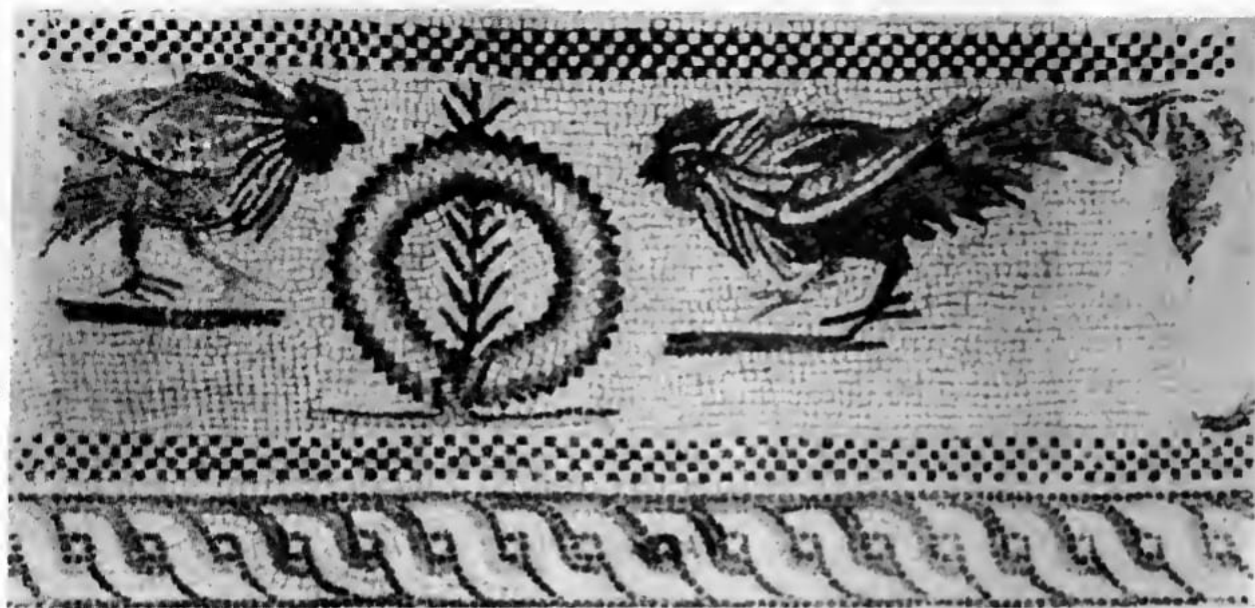
Fig. 1. Fighting cocks. Roman mosaic from Oescus, North Bulgaria (3rd century A. D.) (after И в а н о в, 1957)

appearance towards the beginnings of the 1st century A. D., while P e t t e r (1973) believes that the Domestic Fowl spread in Asia Minor and the Mediterranean about 750 B. C. He also notes the cause of the transformation of the cock into a sacred bird — because of the high egg-laying capacity of hens, cock were declared sacred, and were sacrificed at altars of the fertility deity. An interesting relief with a figure of a cock combined with the sculpture of a phalos, from the island of Delos, was dated from the 3rd century B. C. (Т а х о - Г о д и, 1989) (fig. 2). Н и к и т и н (1948) believes that Greece was the first main centre of the spread of the Domestic Fowl in Europe, which had been introduced from Persia in 330 B.C. У м а н с к а я (1972) points out that domesticated fowl has been known in Middle Europe since 8th century B.C., while in Western Europe it has appeared in 10th — 6th century B.C.