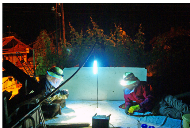
Fig. 1. The light trap setup in this study – a car battery powered UV bulb (125W) strung 1 m above the roof, above a white sheet on the ground.

Weather parameters possibly affecting the aerial dispersal of Sigara striata (Linnaeus, 1758) were explored by fitting quasi-Poisson generalized linear model (GLM). The model building was performed in the package stats (R Core Team, 2016) using the function glm . The dependent variable was the number of captured S. striata individuals for each collecting session. A range of weather variables (tem-