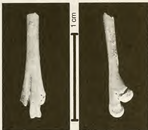
Fig. 1. Actitis balcanica sp. n., tarsometatarsus dex. dist., NMNHS-45 (holotype): a - cranial view, b - medial view

ed fauna of mammals (SPASSOV, 1998; V. Popov - pers. comm.) attributes the site to the MN 17 zone according to the chronostratigraphical system of MEIN (1990).