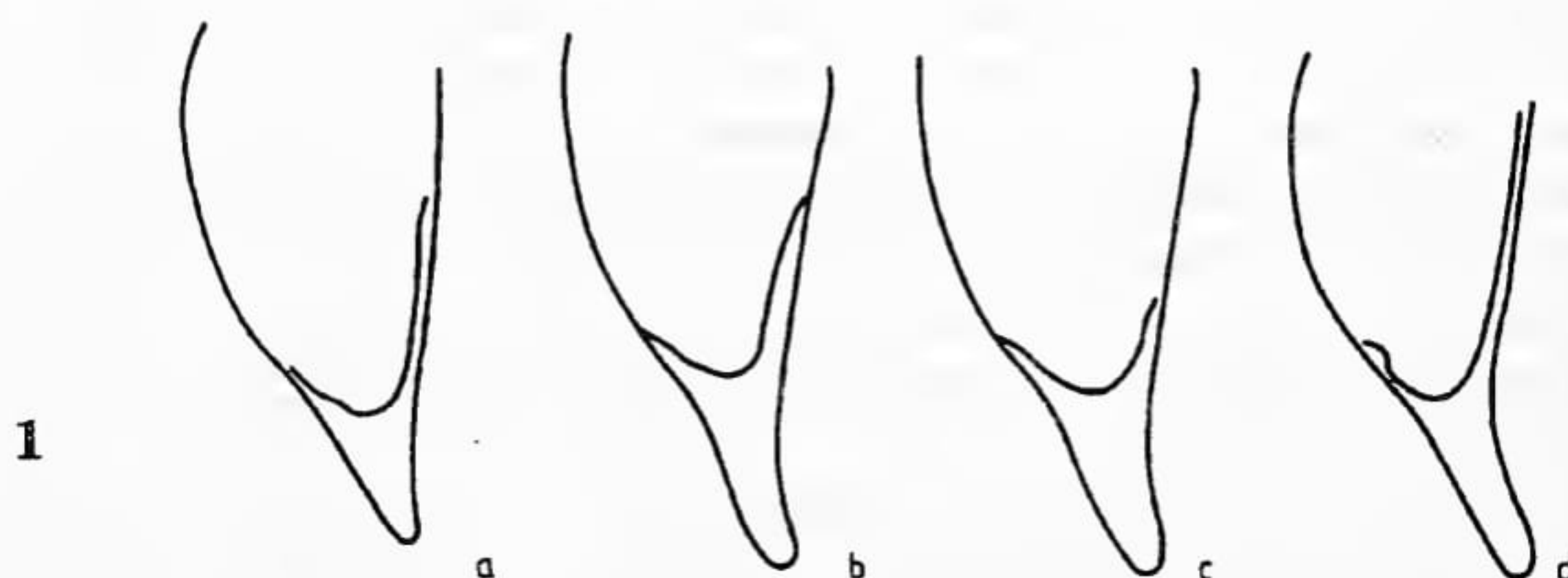
Fig. 1. Aedeagus top (dorsal view): a - Molops rufipes golobardensis Mlynar from Zemen Gorge; b - Molops rufipes denteletus n. subsp., holotype; c - Molops rufipes denteletus n. subsp., variation; d - Molops rufipes rufipes Chaudoir (after Mlynar)

Elytra convex and oval; EW/PW 1,05-1,16 (M 1,11) in 51 males, while 1,14-1,22 (M 1,18) in 29 females; shoulders elytrae angulate; scutellar stria not reach to sutura (sometimes missing of one elytra), without basal pore; intervals smooth and impunctate.