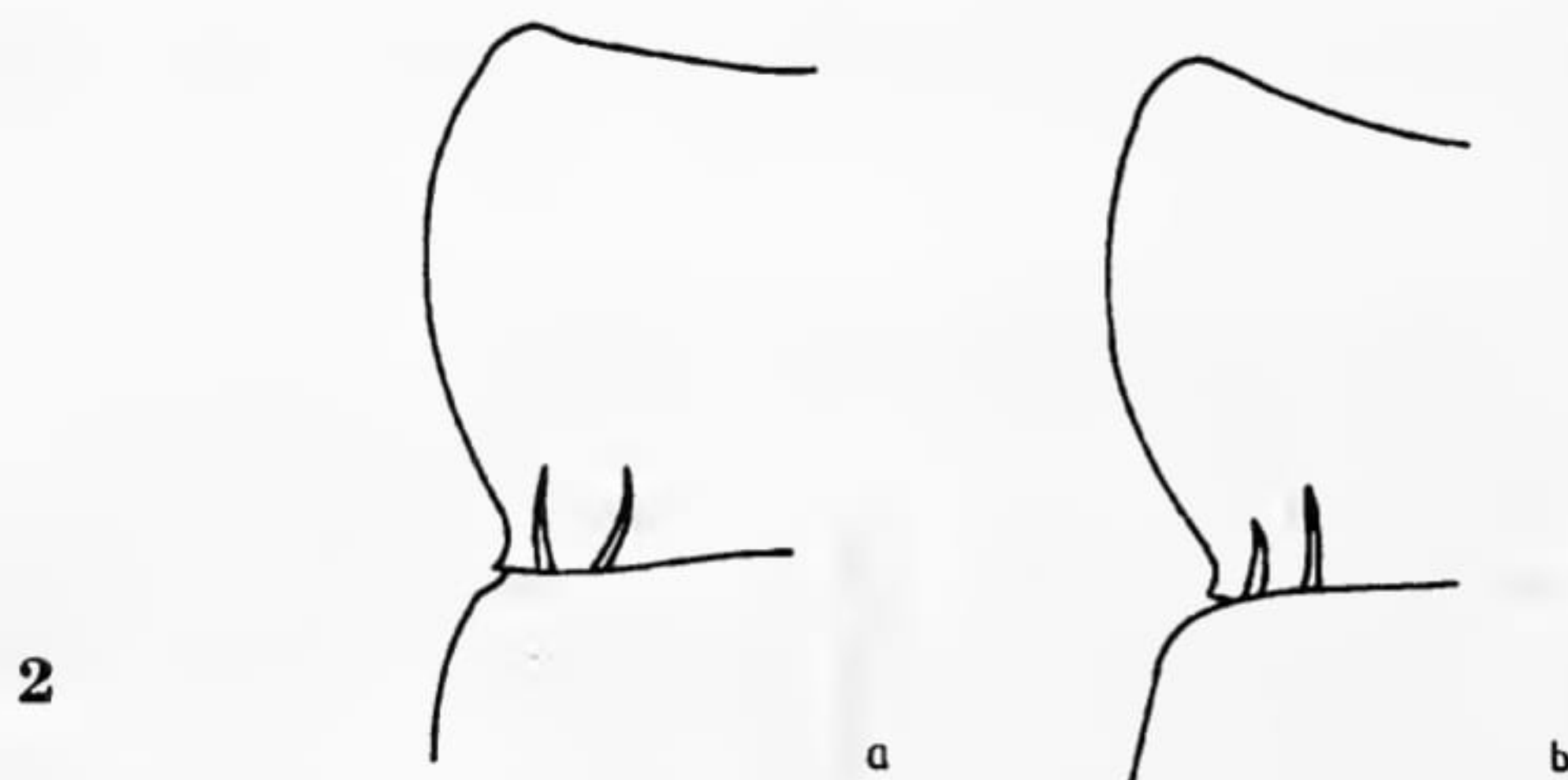
Fig. 2. Pronotum: a - Molops rufipes golobardensis from Golo Burdo Mt. (type locality), male; b - Molops rufipes denteletus n. subsp., holotype, male